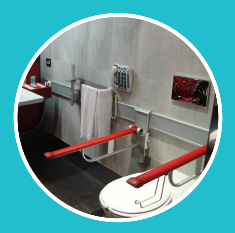
Pressalit Care's vertically and horizontally adjustable support arms (RF548) implemented in Confortel bathroom.

After working together with Aquacontrol, located in Madrid, the architect ultimately chose the full flexibility of the Pressalit Care solution for the project.