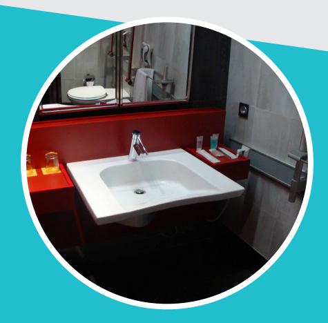
Pressalit Care's electrical vertically adjustable wash basin bracket adjustable 300 mm in height (R4270). Here shown with locally customized piece of furniture as well as sink and faucet which are not from Pressalit Care's assortment.

With electrical wash basin brackets, horizontally and vertically adjustable support arms for toileting as well as horizontally and vertically adjustable shower chairs for the shower section of the bathroom, Confortel is able to offer functionality and comfort to all guests.